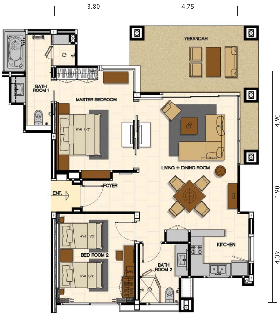
Apartment Type B